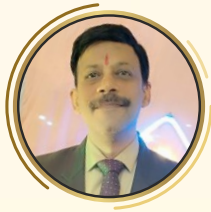
Mr. Rohit Sharma